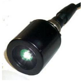
LED Light Module