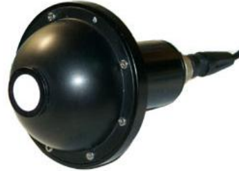
Uniform Light Source